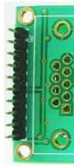
Drawing 1 GPIO pin assignments.