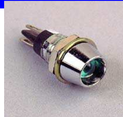
LED-440G 2 volt version shown

The Model 440 LED Indicator Light is a larger version of the Model 407. Available with either chrome body or black anodized body. Voltage range from 2-24 VDC with built in resistor. It mounts in an 8 mm panel hole. The 2 volt version is slightly shorter.