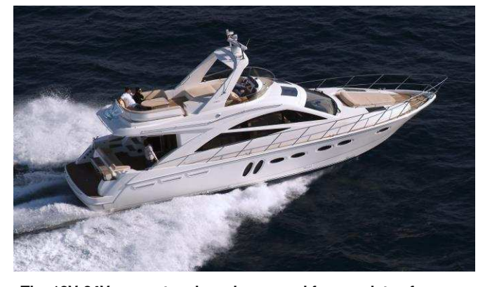
The 12V-24V converters have been used for a variety of applications including bus ticketing systems on mini buses and for 24V bow thrusters on leisure craft.

A red LED indicates when there is output from the converter. This gives reassurance to the installation engineer and speeds fault finding.