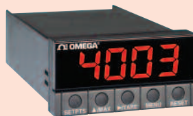
DP25B-RTD process meter/controller, $285, see page M-25.