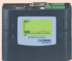
OM-SQ2010 data logger, $1540, see page R-26.