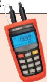
HH804U meter, $149, see page L-17.