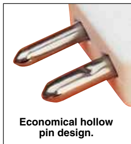
Economical hollow pin design.

We make running changes when technical advances allow. Check at time of ordering for additional features.