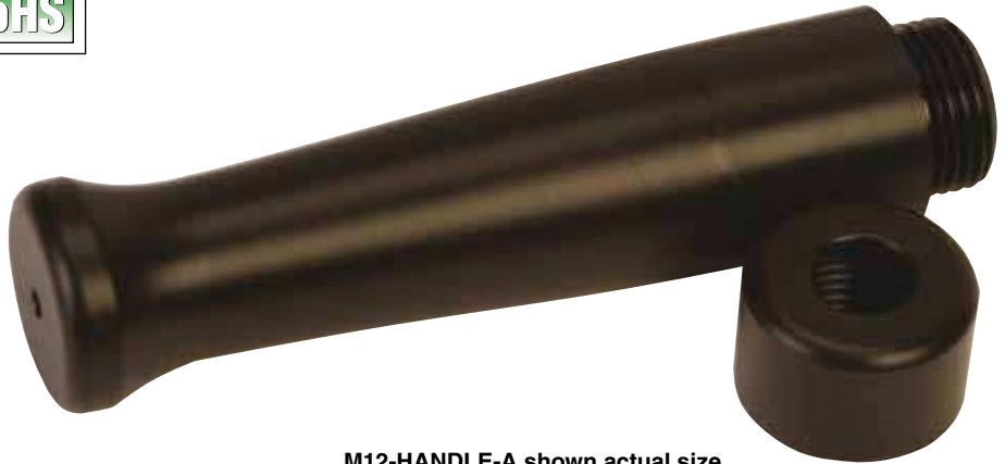
M12-HANDLE-A shown actual size.

NEWPORT heavy-duty M12 probe handle provides a fast, easily connected system of handheld probes for a broad range of applications. Sensing elements can be quickly changed or replaced in the field without tools. The M12 probe slides through the handle allowing the connector to be exposed at the end. Handles are compatible with TH-21A Series thermistors, PR-21A and PR-25AP Series RTDs and M12 Series thermocouples. Example: M12KIN-1/4-U-12-A, see accessory chart.