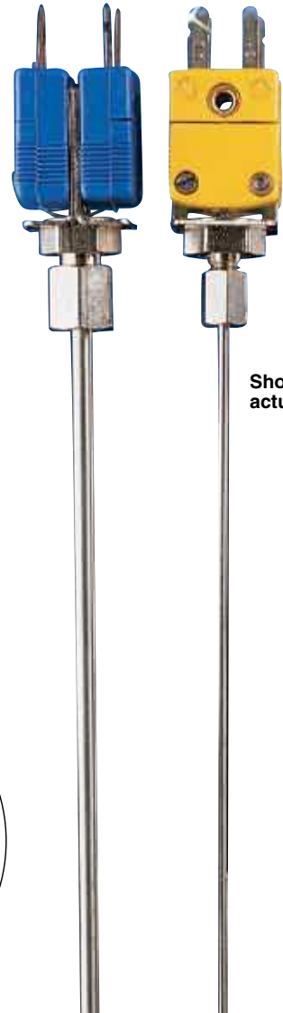
Shown actual size.