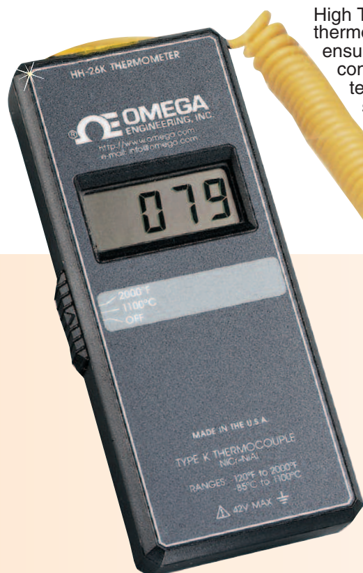
Probe shown with model HH-26K Handheld Thermometer. For complete details on this meter, and hundreds of others, see Sections "J", "L" and "Q".

High Temperature Surface Probe features a thermocouple alloy spring-loaded sensing element to ensure consistent readings. The 300 mm (12") probe comes with an SMPW Male Connector termination and a 0.3 mm (1') retractable sensor cable (stretches to 1.5 m (5')). Available in thermocouple Types J, K, or E, the HPS-HT probe can measure temperatures up to 1100°C (2000°F), Type K only.