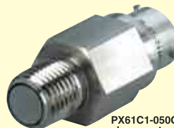
PX61C1-050GV, $425, shown actual size.