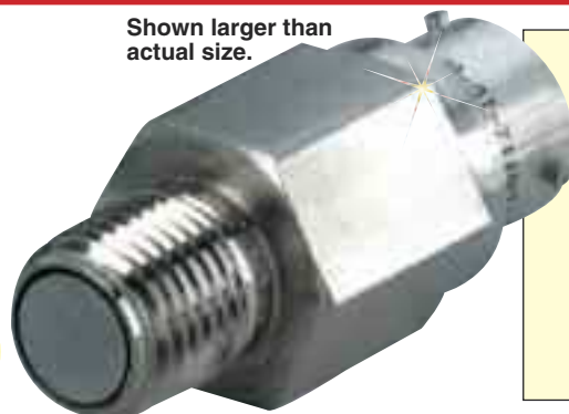
Shown larger than actual size.