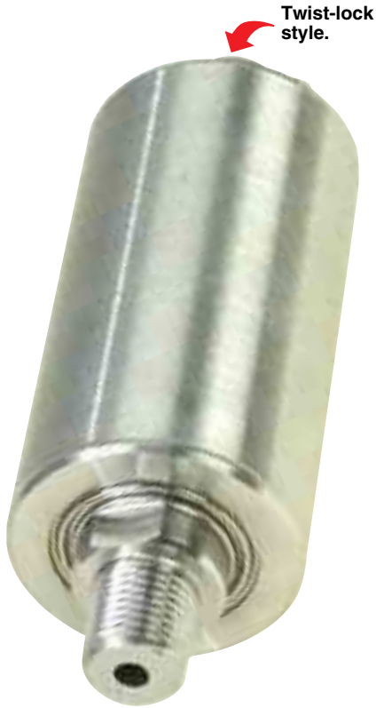
METRIC PXM6000MC1-010BARAI, $560, shown actual size.