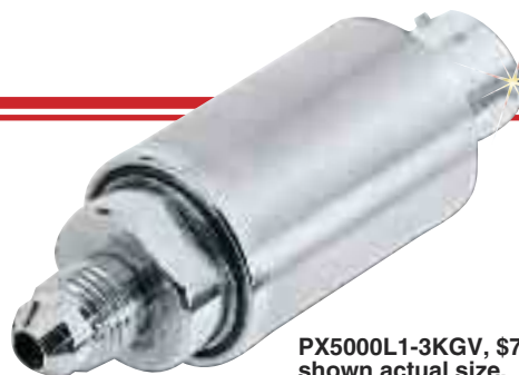
PX5000L1-3KGV, $750, shown actual size.