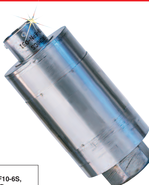
PX35K1-1KGV, $360, shown actual size.