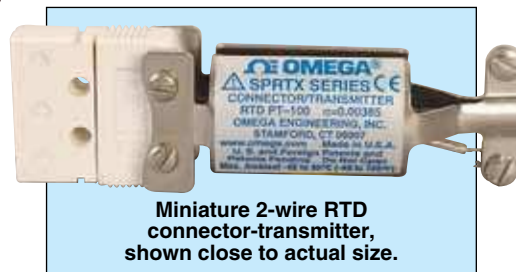
Miniature 2-wire RTD connector-transmitter, shown close to actual size.

Each connector-transmitter comes fully assembled, complete with connector, built-in transmitter and 3 m (10') of cable.