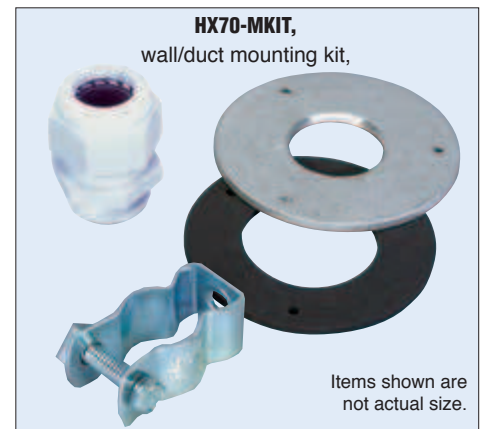
HX70-MKIT, wall/duct mounting kit,