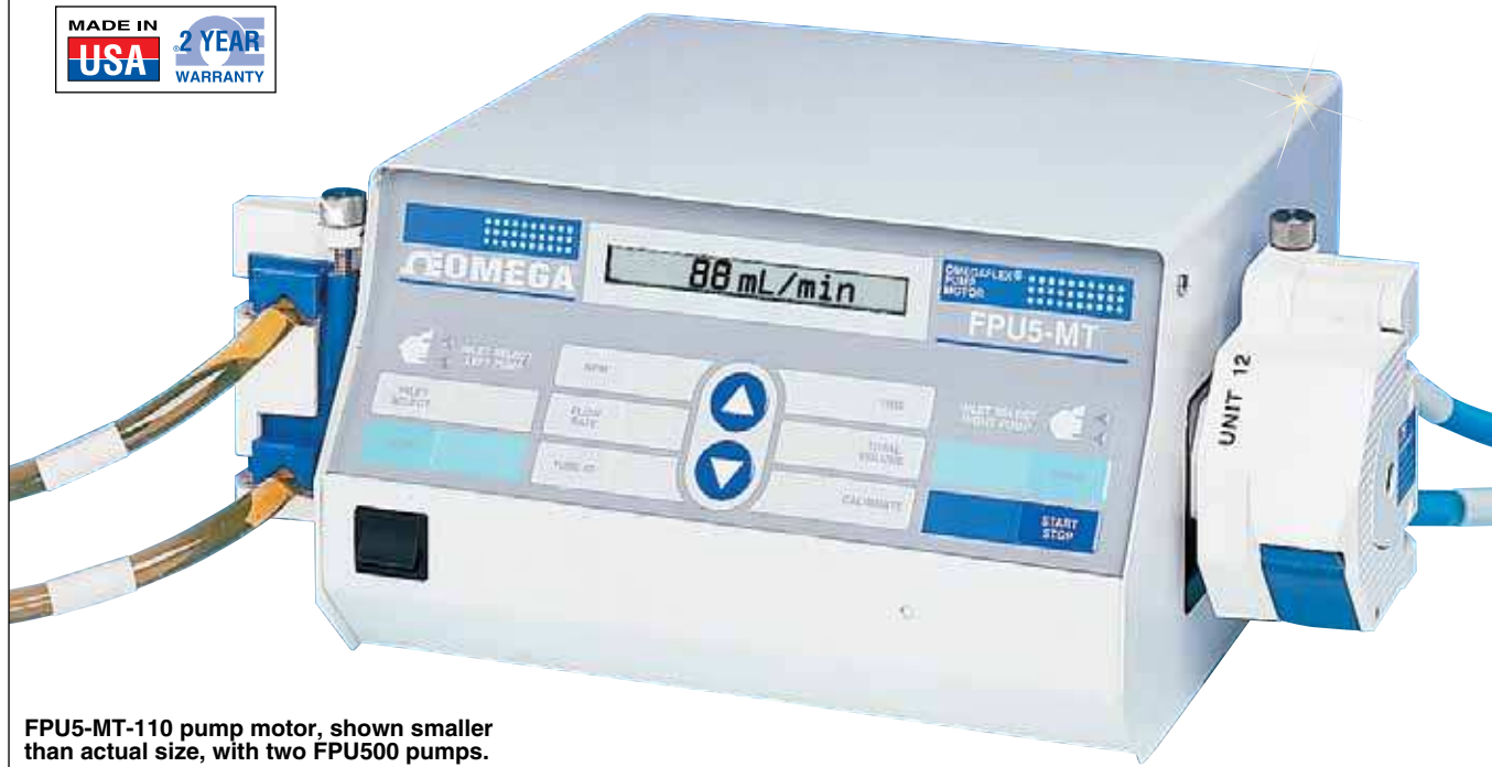
FPU5-MT-110 pump motor, shown smaller than actual size, with two FPU500 pumps.