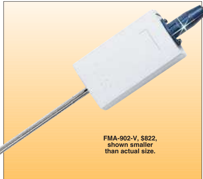
FMA-902-V, $822, shown smaller than actual size.

The unique FMA-900 air velocity transducer utilizes both a velocity sensor and a temperature sensor to accurately measure air velocity (in SFPM, standard feet per minute). The built-in temperature sensor automatically corrects the flowrate for temperature variations. Both sensors are rugged glass-coated Platinum resistance detectors (RTDs). The circuit heats the velocity sensor to a constant temperature differential above ambient temperature and measures the cooling effect of the air flow. This design provides excellent low velocity sensitivity and high accuracy. The FMA-900 also features negligible pressure drop.