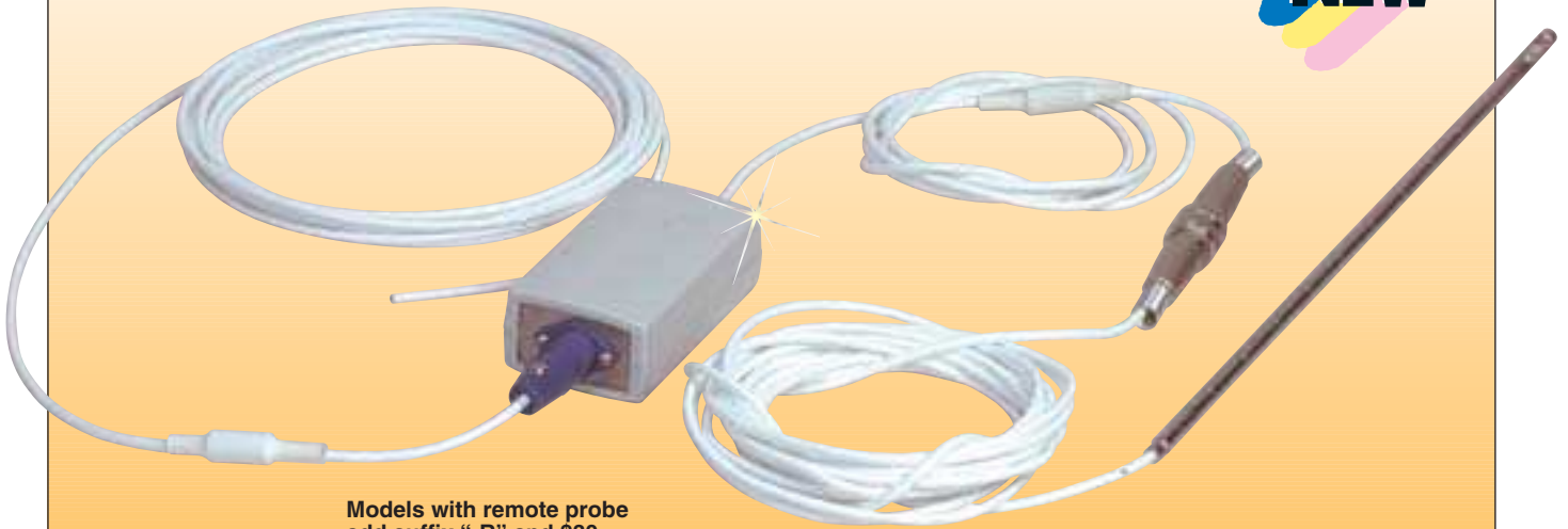
Models with remote probe add suffix "-R" and $30.