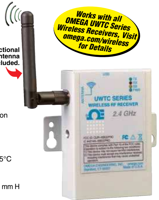
UWTC-REC1. Shown smaller than actual size.

Works with all OMEGA UWTC Series Wireless Receivers, Visit omega.com/wireless for Details