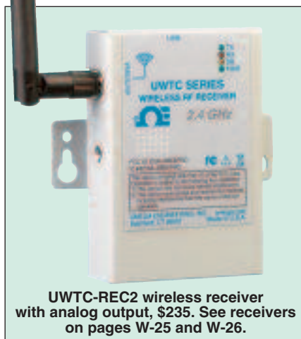
UWTC-REC2 wireless receiver with analog output, $235. See receivers on pages W-25 and W-26.