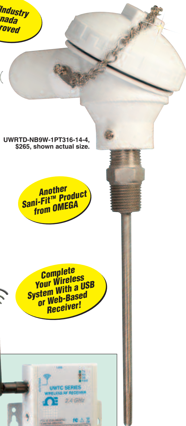
UWRTD-NB9W-1PT316-14-4, $265, shown actual size.