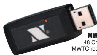
MWTC-REC5-915 48 Channel MWTC receiver