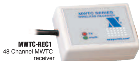
MWTC-REC1 48 Channel MWTC receiver

Battery Life (Typical): 7.2 months at 1 sample per minute at room temperature