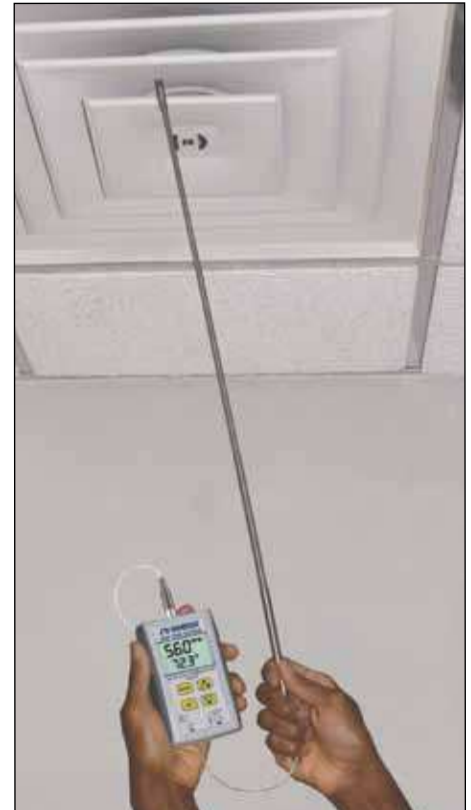
Measuring air flow from an air conditioning duct.

Outdoor/Line of Sight: Up to 120 m (400')