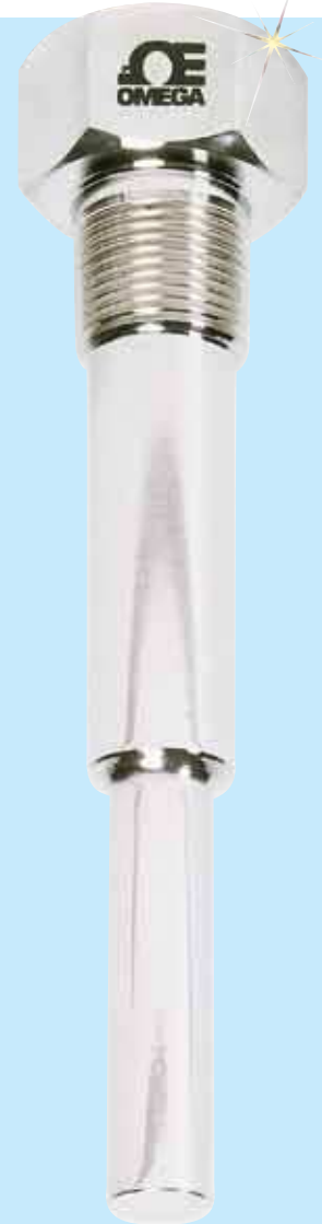
Shown close to actual size.

† NPSM internal pipe thread will accept both NPT and NPS male threads.