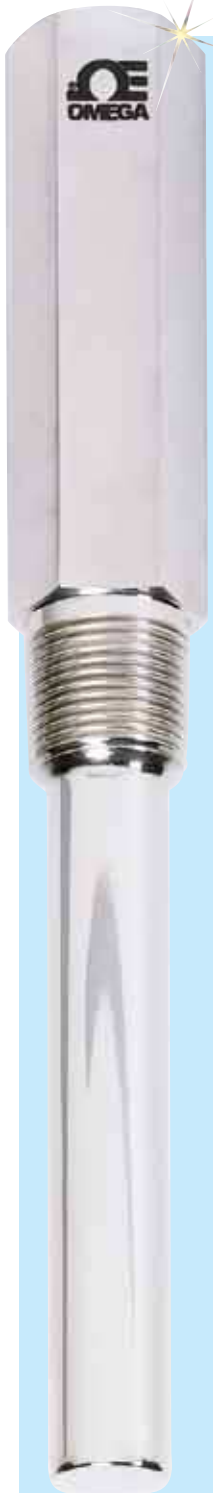
Shown close to actual size.

For 304SS cap, add suffix "-CC" to the end of the model number for an additional cost.