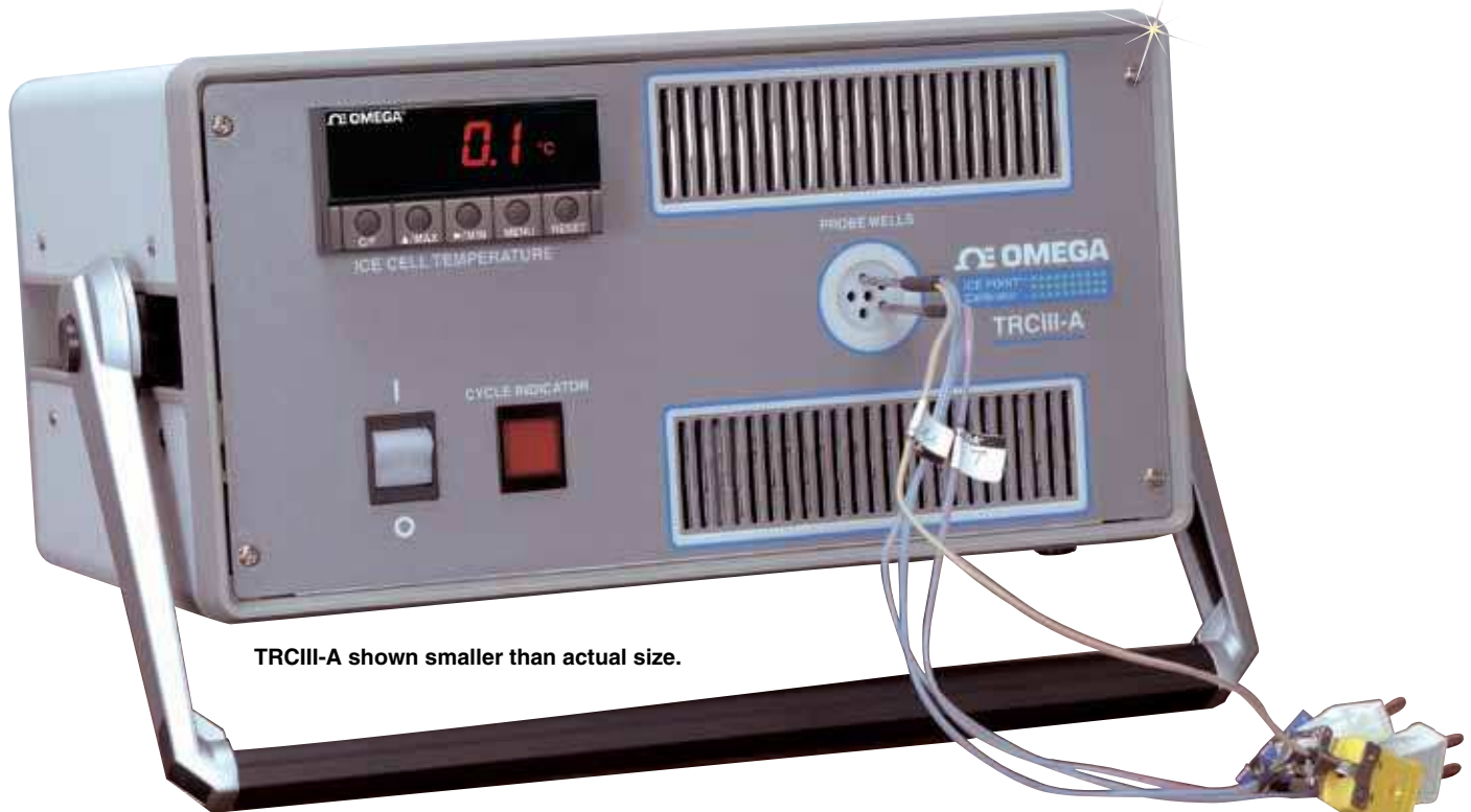
TRCIII-A shown smaller than actual size.

Probes sold separately; please next page.