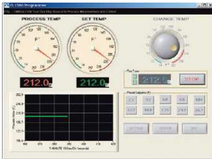
Sample screen showing CL1500 software that is included.