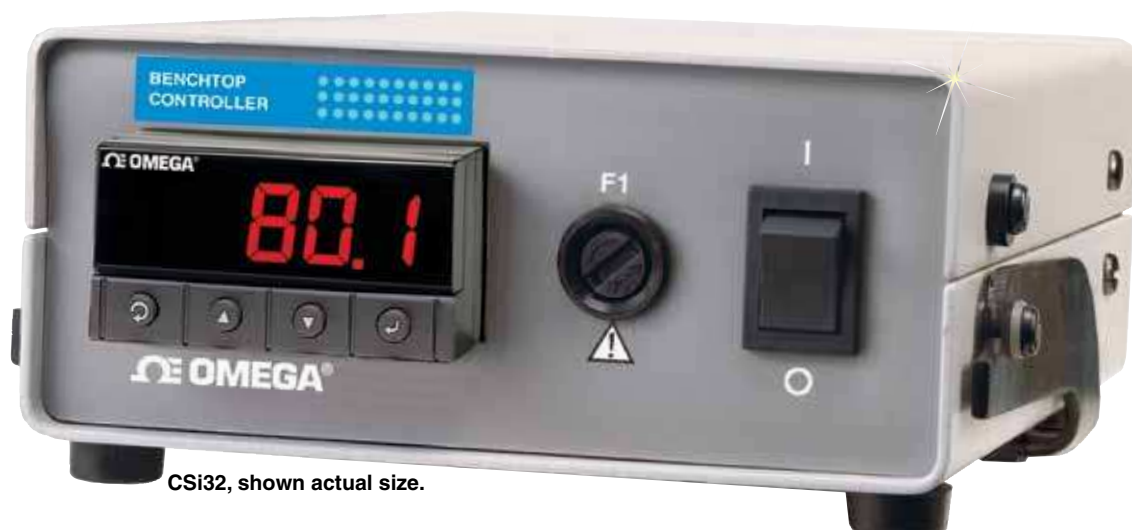
CSi32, shown actual size.