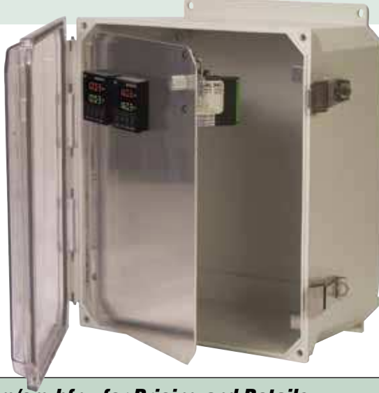
OM-HFPU120-116DIN-2 shown installed in OM-AMU1206LCCF fiberglass enclosure with two CNI Series 1/16 DIN controllers, shown much smaller than actual size.