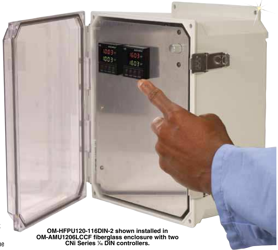
OM-HFPU120-116DIN-2 shown installed in OM-AMU1206LCCF fiberglass enclosure with two CNI Series \frac{1}{8} DIN controllers.

OM-AMU series non-metallic fiberglass enclosures are designed to insulate and protect electrical controls and components in both indoors and outdoors applications and are especially well suited for higher temperatures and corrosive environments. These NEMA 4X (IP66) fiberglass JIC junction boxes feature clear polycarbonate covers with a variety of screw or latching options.