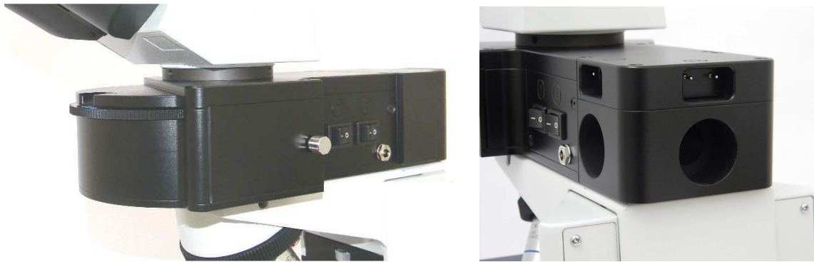
FLUOLED ® 2CFW: side view with detail of ON/OFF switch (left) rear view with slots for LED cassettes (right)

The machined aluminium illuminator body offers increased stability and protection of the optical and electronic system components. The filter slider is completely dust protected and allows for the insertion of fluorescent filter sets mounted on filter cubes.