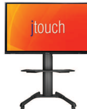
INF6501a on optional Pro Mobile Cart with optional Accessory Shelf

Secure the JTouch to the wall with its standard VESA mounting pattern or mount it on an optional InFocus mobile cart. A mobile cart lets you position it in multiple locations within a room or share it between multiple rooms — wherever it's needed most.