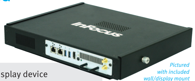
Pictured with included wall/display mount

Connect MondoCenter to any display device to visually present, capture and share ideas with participants in the room and around the world. It's a Mondopad without the "pad."