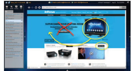
Web Browsing with Annotation