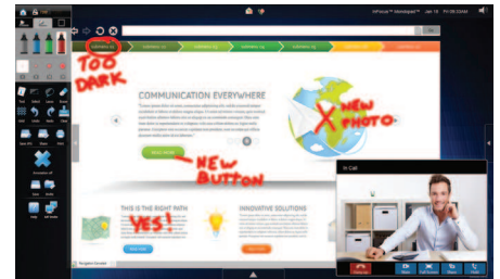
Whiteboard and Annotation