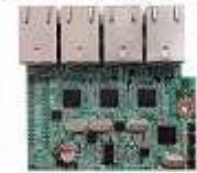
ADE4INLANG 4-port Intel LAN