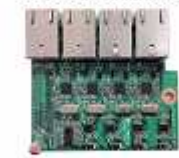
ADE4RTLANG 4-port Realtek LAN