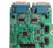
ADE4COMCB 4-port RS232 Serial