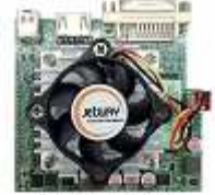
ADE4HV13M NVIDIA 610M GPU