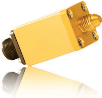
Made in USA