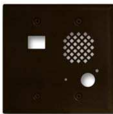
PNL65-BN (Oil Rubbed Bronze)