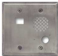
PNL65-SS (Brushed Stainless Steel)

Update Your E-65 Series Phone to a Unique Faceplate Finish or Replace an Existing Damaged Faceplate