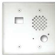
PNL65-WH (Satin White)