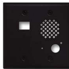
PNL65-BK (Fine Texture Satin Black)

The PNL65 is a replacement faceplate with color matching screws and LED light pipe for the E-65 Series entry phones.