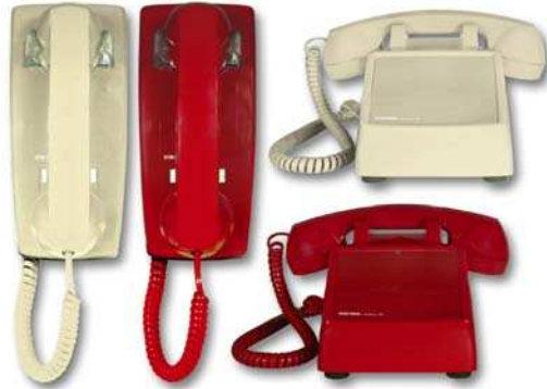
K-1500P-W Ash / Red