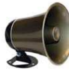
One Viking model 25AE Paging Horn included