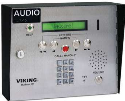
AES-2000S Surface Mount