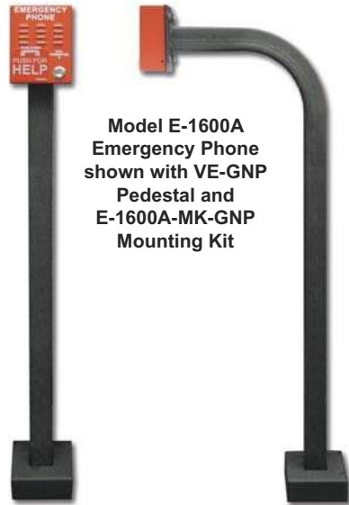
Model E-1600A Emergency Phone shown with VE-GNP Pedestal and E-1600A-MK-GNP Mounting Kit