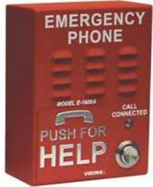
E-1600A Emergency Red

The 1600A Series ADA Compliant Emergency Phones are designed to provide quick and reliable hands-free communication for any standard analog telephone line or analog phone system station port. All 1600A Series phones meet ADA requirements for elevator/emergency telephones, and can be programmed from any Touch Tone phone. The phones can dial up to 5 programmable emergency numbers, as well as 2 central station numbers.