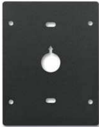
E-1600A-MK-GNP Mounting Plate

The kit includes stainless steel mounting hardware, two gaskets to seal the back of the Emergency Phone and a durable powder coated 12 gauge steel mounting plate.