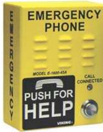
E-1600-45A Safety Yellow