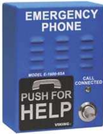
E-1600-65A Emergency Blue