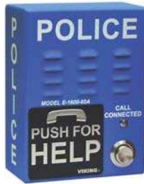
E-1600-60A Police Blue