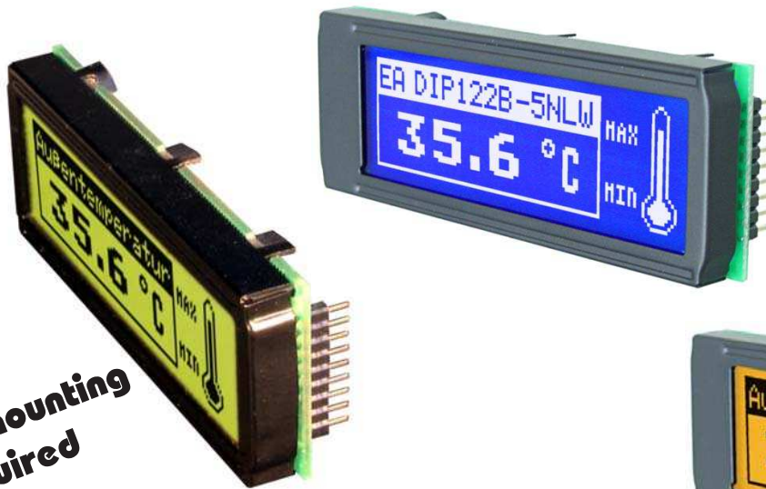
blue-white: EA DIP122B-5NLW Dimension 75 x 27 mm