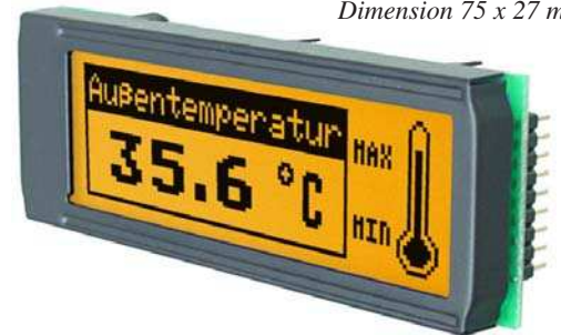
amber: EA DIP122J-5NLA Dimension 75 x 27 mm