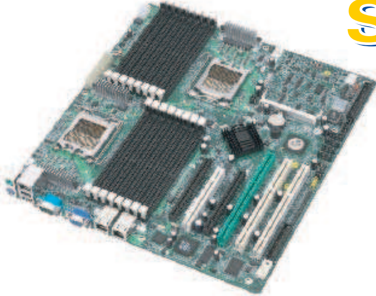
Thunder h2000M S3992