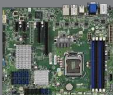
■ Intel® C222 Chipset