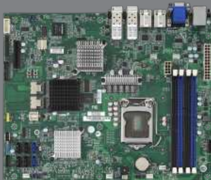
■ Intel® C222 Chipset