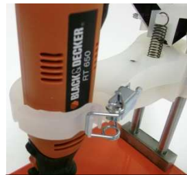
BLACK & DECKER RT650