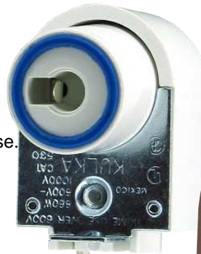
532.1 Spring Loaded

Termination: Lead wires 9" (228.6 mm) long, 18 AWG stranded and tinned lead wires, 1/2" stripped, standard. Wire rated: AWM 1000 V, 90°C (194°F).