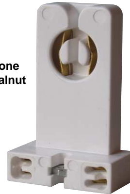
1551.P Turn style tombstone lampholder with palnut

Special: Item can be factory wired per customer specifications for length, strip and wire material.