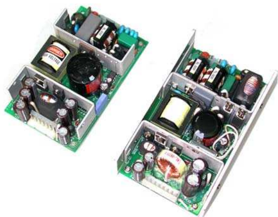
Open Frame = 5.00 x 3.00 x 1.10" / U-Frame = 5.50 x 3.29 x 1.57"