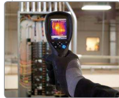
Find Hot Spots Fast!