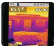
Excellent 2.8" Color LCD Shows the Whole Scene