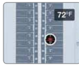
IR Thermometer Single Spot