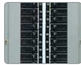
Human Eye View