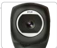
Focus-free Lens for Point-and-Shoot Simplicity