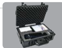
Includes Hard Case