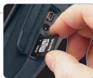
Removable SD Card and USB Output for Fast Image Downloads