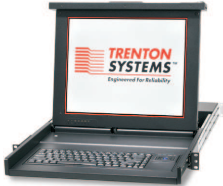
Trenton TKM1500 Monitor / Keyboard Drawer Factory-configured with a 17" LCD and full-size keyboard