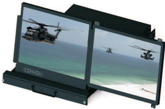
Trenton TMM2500 Dual LCD Monitor Drawer Factory-configured with two 19" LCDs in a retractable drawer