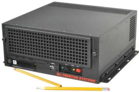
Trenton TVC3401 Shelfmount / Wallmount Video Controller Shown with a MicroATX motherboard