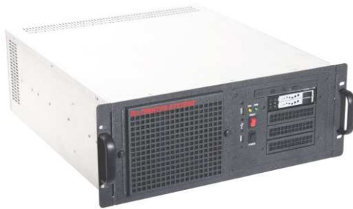
Trenton TVC4402 Video Controller Shown with a 14-slot form factor backplane and a single board computer