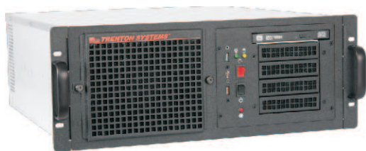
Trenton TVC4406 Video Controller Shown with an ATX motherboard